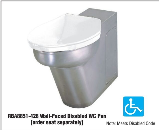
RBA8851-428 Wall-Faced Disabled WC Pan [order seat separately]