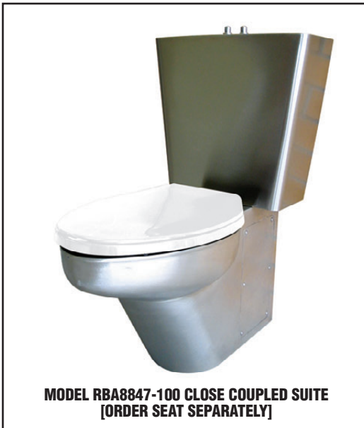
MODEL RBA8847-100 CLOSE COUPLED SUITE [ORDER SEAT SEPARATELY]