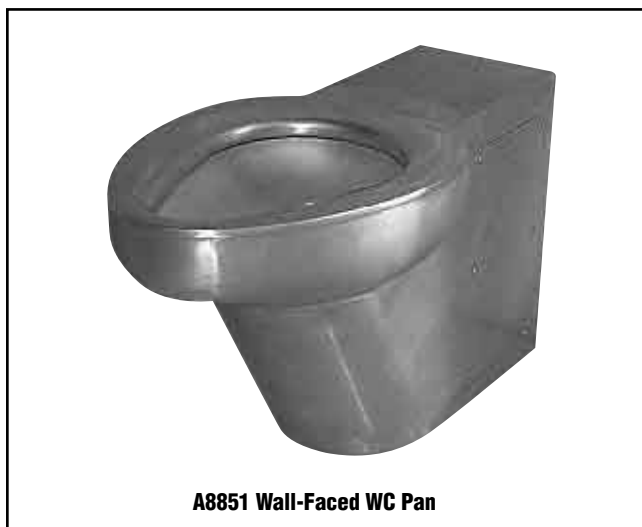
A8851 Wall-Faced WC Pan